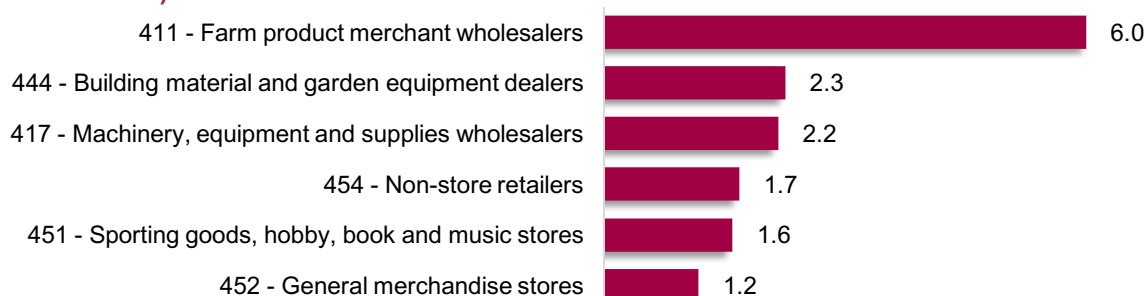
Figure 2: Trade-related sectors with a high concentration of firms relative to the Ontario economy (Ontario = 1.0)

There are 28 firms in the truck transportation sector of which 21 are sole-proprietors.