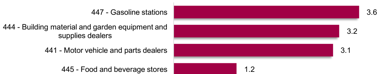
Figure 2: Trade-related sectors with a high concentration of firms relative to the Ontario economy (Ontario = 1.0)

There are 44 firms in the Warwick construction sector of which 22 have formal employment. The community has a much higher concentration of firms in the specialty trade contractor sector compared to the province as a whole (two times as many adjusted for population size). Warwick has nine manufacturing firms of which four have formal employment. There are four firms in wood and furniture-related manufacturing. There are 35 firms involved in wholesale and retail trade. Figure 2 shows the sub-sectors with higher than average concentration.